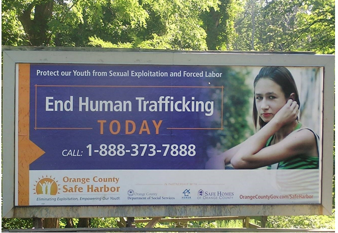
Safe Homes, along with OC Safe Harbor, OC Department of Social Services, and HONOR, is proud to be part of a county wide campaign for human trafficking awareness and outreach. The above billboard can be found on Route 9W in Newburgh and in New Windsor.

In collaboration with Legal Services of the Hudson Valley, Safe Homes Family Justice Center housed a full-time attorney and paralegal who handled 117 cases assisting clients with orders of protection, custody, visitation, divorce, and child and spousal support.