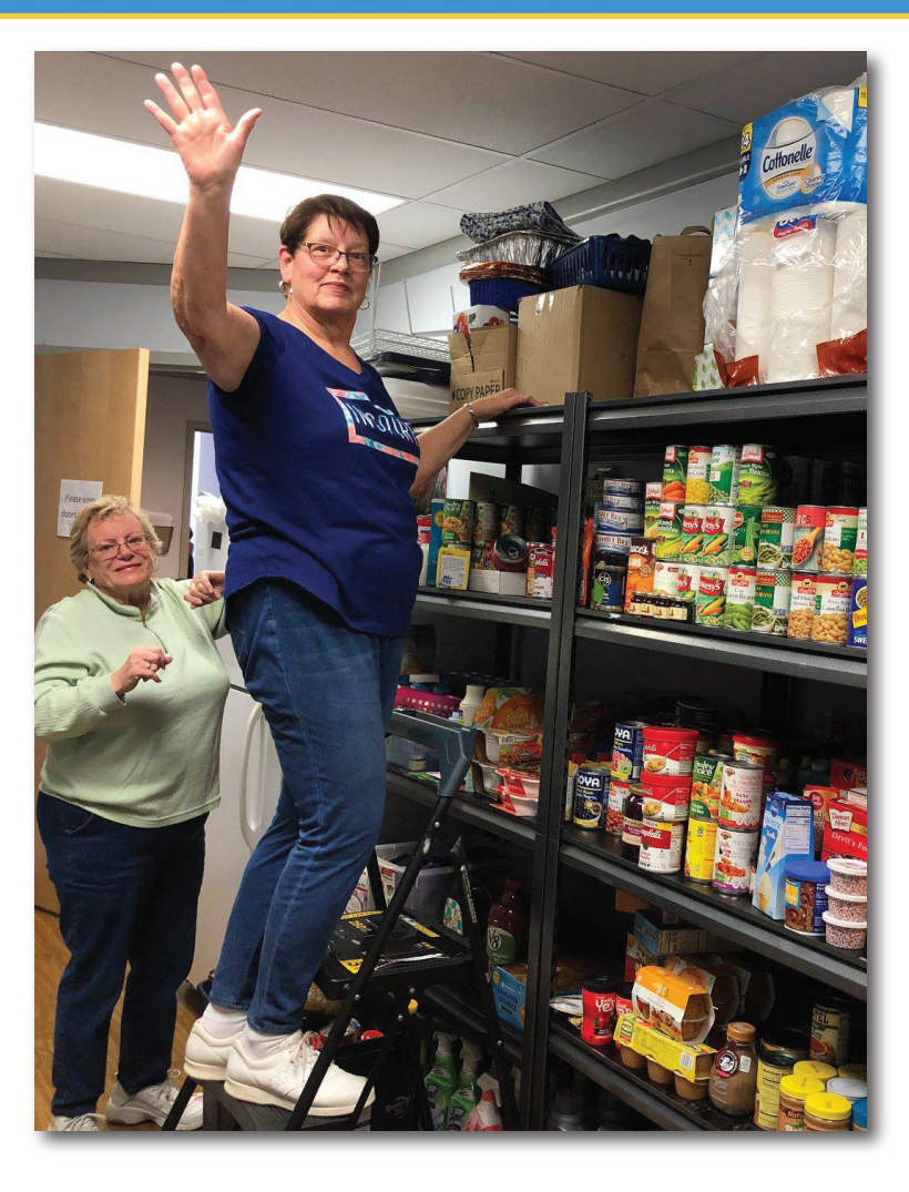
Orange County Family Justice Center

We cannot thank these two amazing women enough for their bright smiles, for the number of hours they have committed to supporting us, and most of all – for how much kindness and heart they bring into the office each time they are here.